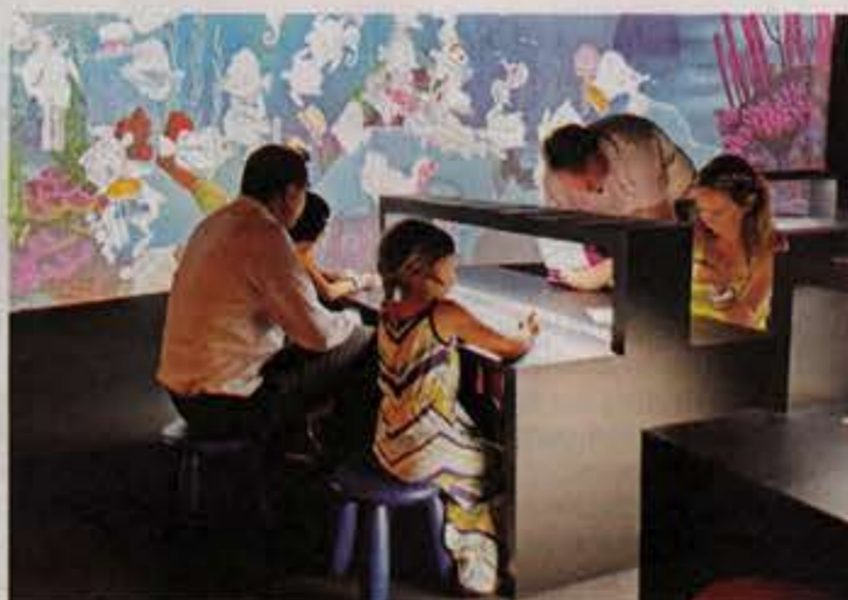
Imaginarium makes a fun-filled visit for both children and adults.

Entrance fees are RM20 for MyKad holders and RM25 for international visitors. Imaginarium is open from 9am to 7pm daily. Find out more at www.ilangkawi.com.my .