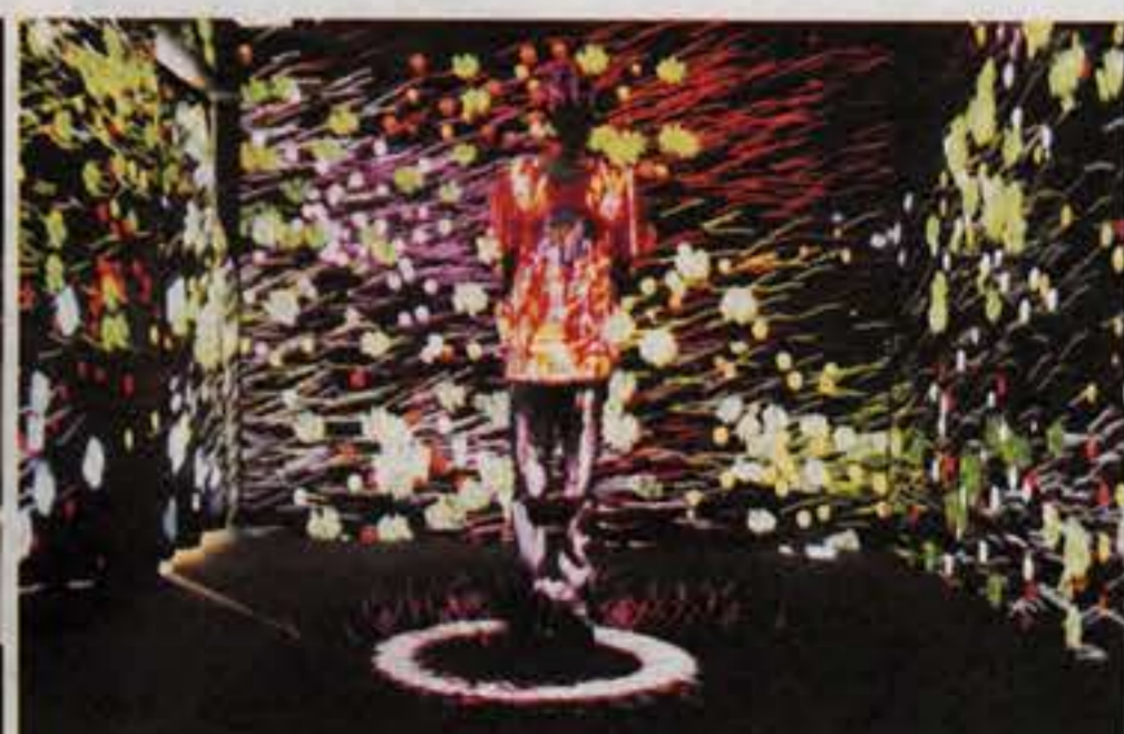
One of the many interactive attractions in store for visitors.